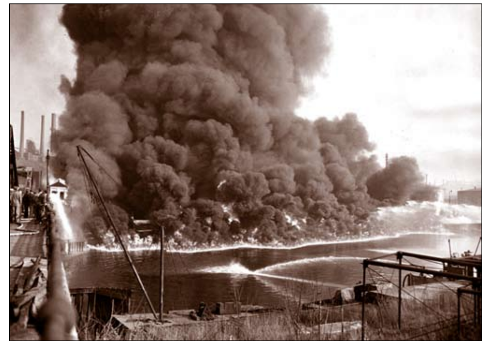
Iconic image of Ohio's Cuyahoga River on fire in 1952. Sadly, this was not the first, or last, time that this horribly polluted river caught fire. Devastation caused by the 1969 fire spurred passage of the Clean Water Act.