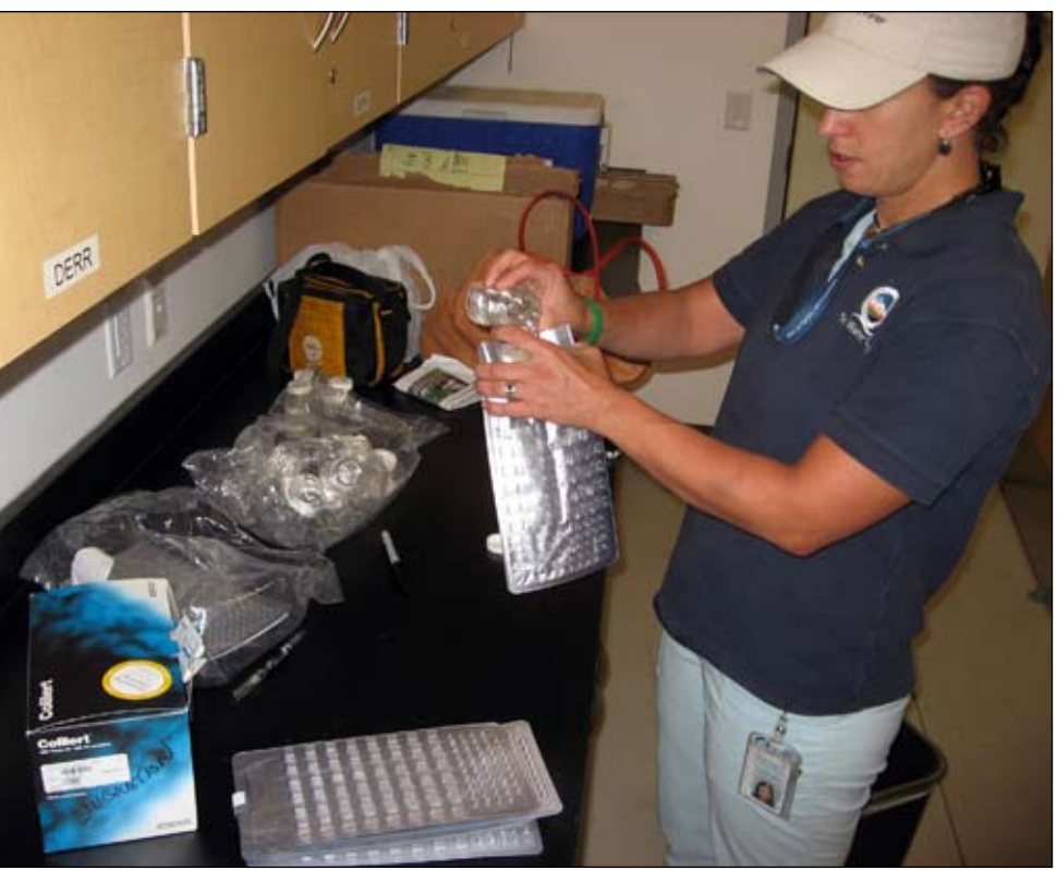
Processing water quality samples in the Division of Water Quality lab.

For more information, go to www.waterquality.utah.gov/TMDL/ JORDAN/index.htm. □