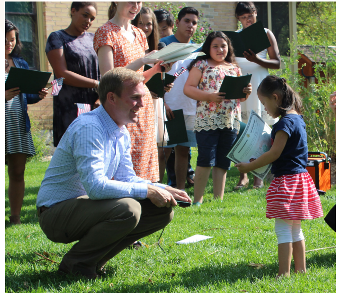
Mayor McAdams greets a newly naturalized citizen

Within my office at Salt Lake County, we've created the Office for New Americans to be a resource to those new to our country, so they can receive targeted support to meet their needs as they build new lives for themselves here.