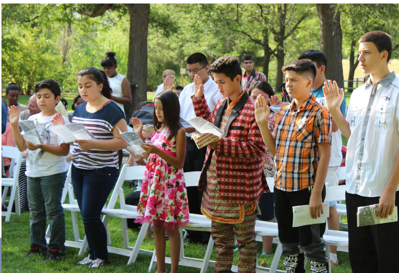
Youth naturalization ceremony Murray, Utah, 2016

Increase the awareness of immigration services and immigration rights