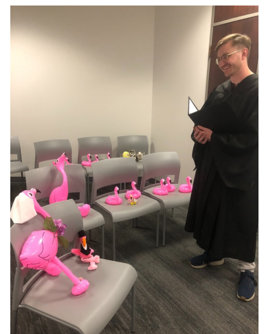
Second Place Clerk's Office