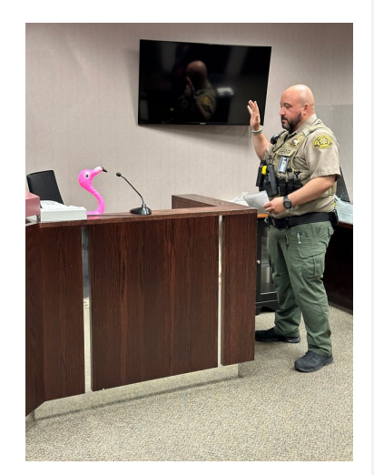
Third Place Justice Courts